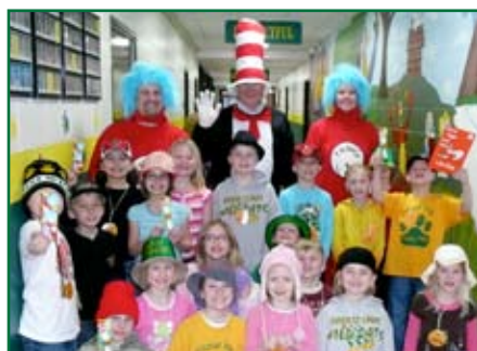
Primary School celebrates Dr. Seuss' Birthday

Congratulations to all of our fall and winter season athletes and coaches on a fine year of competition. Special congratulations to our Girls Hockey team who were able to participate in the MN State Hockey Tournament this year as well as winning the section academic award.