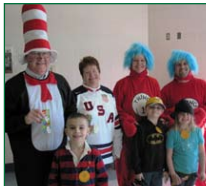
Primary School celebrates Dr. Seuss' Birthday

On a brighter note, we congratulate the nearly 270 seniors that will be graduating as part of the Class of 2010. We are proud of your accomplishments and leadership and wish you the best of luck in your future endeavors. We will also be holding kindergarten roundup in the month of April for all families who will be enrolling a kindergartener in our district for the coming school year. Contact Chisago Lakes Community Education, Primary School or Taylors Falls Elementary for more information regarding the options available for kindergarten for the coming year. There have been major changes in kindergarten programming that need to be communicated to all parents of incoming kindergarten students.