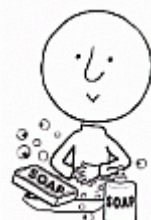
Cover your cough!