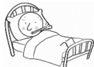
Stay home when sick.